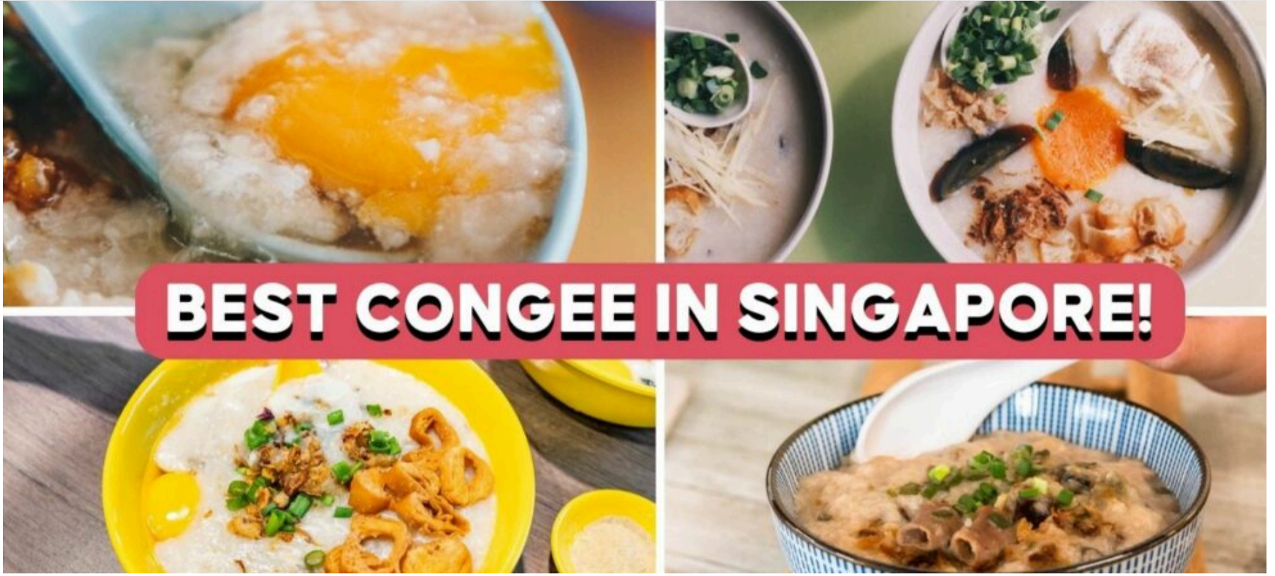
Feature image adapted from Four Points FB and Plate Restaurant.