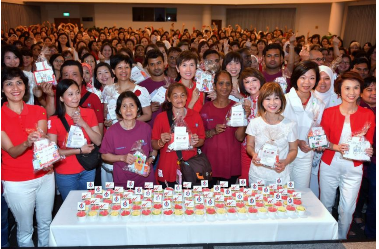
Manpower Minister and chairman of the PAP's Women's Wing Josephine Teo with other members of the wing, activists and representatives of town council cleaners during an International Women's Day celebration on March 7, 2020.